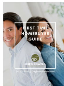
First Time Homebuyer Guide