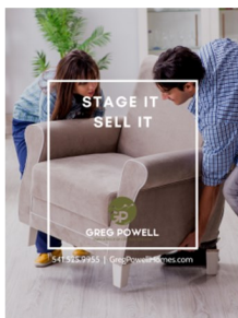
Stage It Sell It