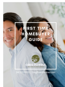
First Time Homebuyer Guide